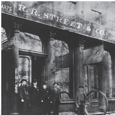
Street's founded in Chicago, Illinois, 1876

For over 145 years, R.R. Street & Co. Inc. (Street's) has been a leader in the textile care industry. You will experience our long time commitment to excellence in the processes we design and recommend, in the products we research, manufacture and market, and in the services and support that we provide. Through decades of industry changes, the Company's overriding commitment and guiding principles have remained the same: "Provide the customer with the highest quality processes, products and services in order to produce the best quality of fabric care and conduct our business with integrity that extends beyond the fabric care industry to society in general."