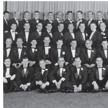
Street's National Salesforce, 1955