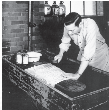
1930's Drycleaning Plant